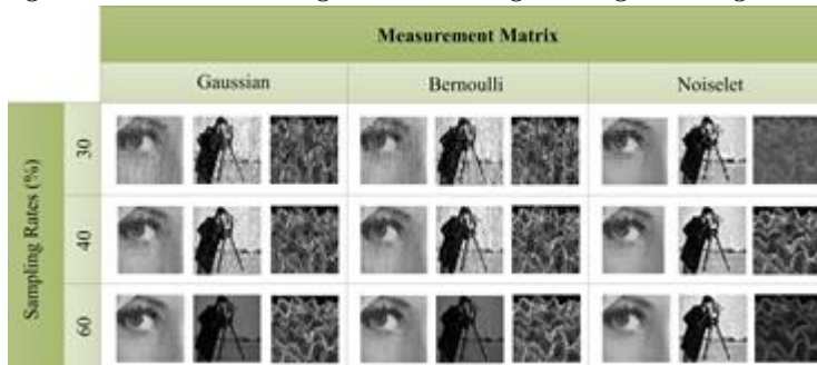
Fig. 3. The recovered images shown in Fig. 2 using PDIP algorithm.