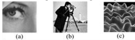
Fig. 4. Test images: (a) Lena eye (b) Camerman (c) Shape.

We should notify that the real and imaginary parts of Noiselets cannot be used separately as a measurement matrix in CS so we have used complex Noiselets in our simulations. The recovered images are shown in Fig. 3 and Fig. 4.